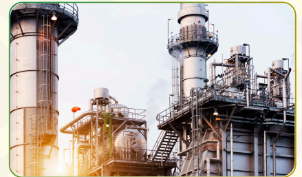
Oil & Gas, Petrochemical