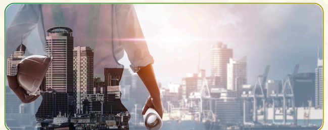
Sectors (Projects, Contract Specific or Services)