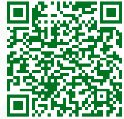
Point of Reference