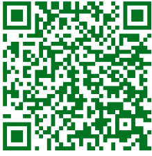
HSE Excellence Awards Part 1 - Organisation Profile & KPQ's