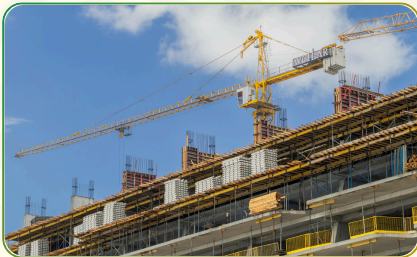
Engineering and Construction