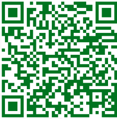
Part III - Application Form