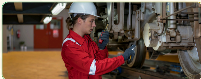
Facility & Maintenance